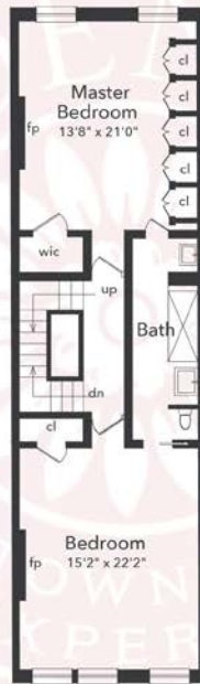
Third Floor Ceiling Height 10'5" approx. 935 sq. ft.