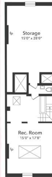
Fifth Floor Ceiling Height 7'8" approx. 935 sq. ft.

133 West 122nd Street approx. 4,745 sq. ft.