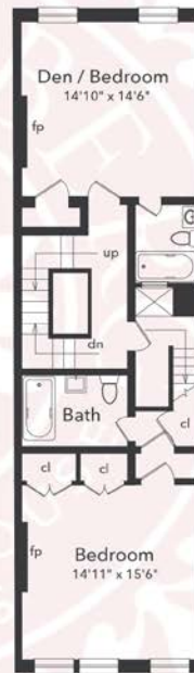
Fourth Floor Ceiling Height 10'1" approx. 935 sq. ft.