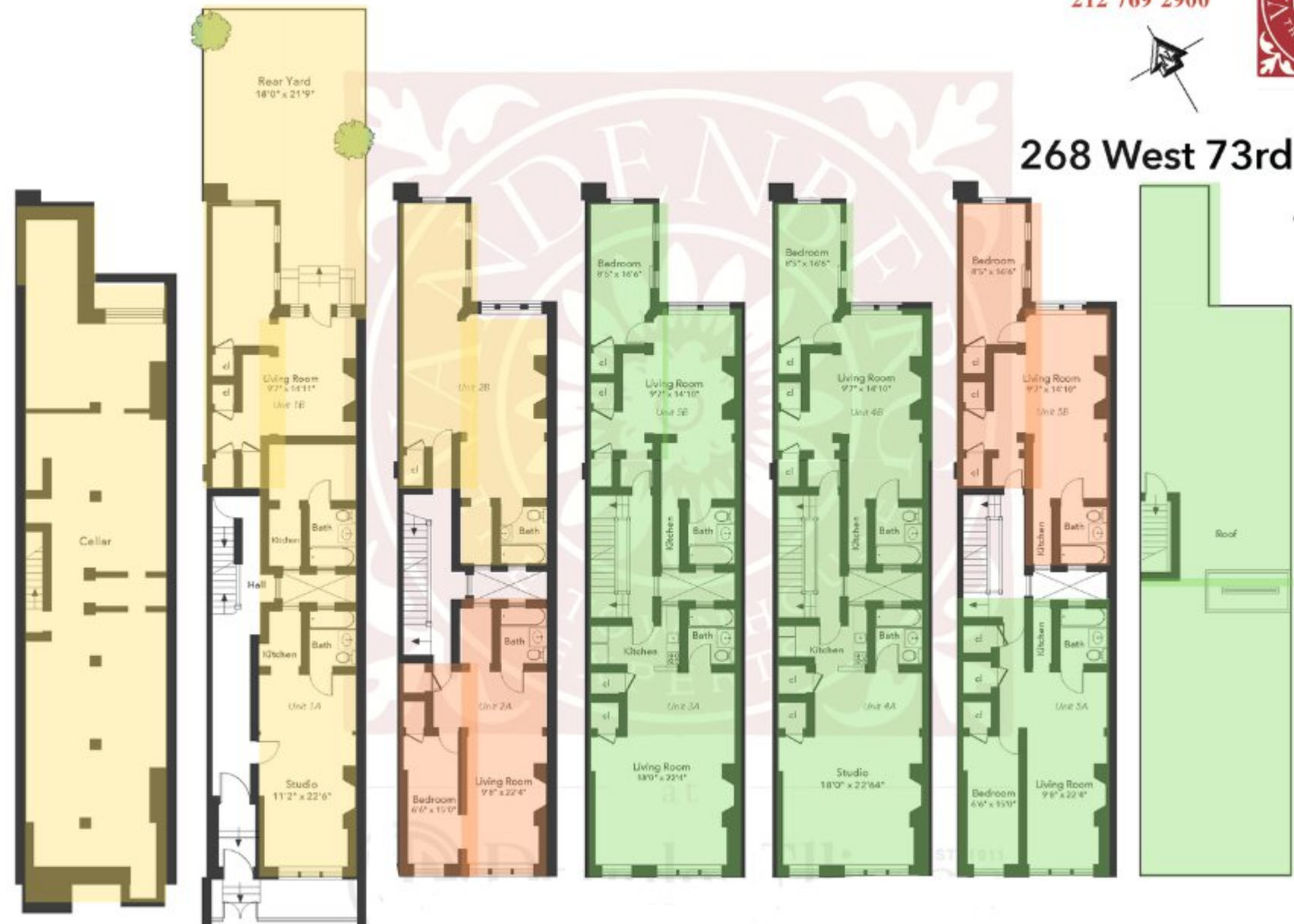
Cellar Ceiling Height 6'10" approx. 1,294 sq. ft.

268 West 73rd Street approx. 6,470 sq. ft.