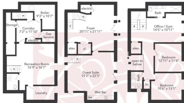
Cellar Ceiling Height 8'5" approx. 1,012 sq. ft.